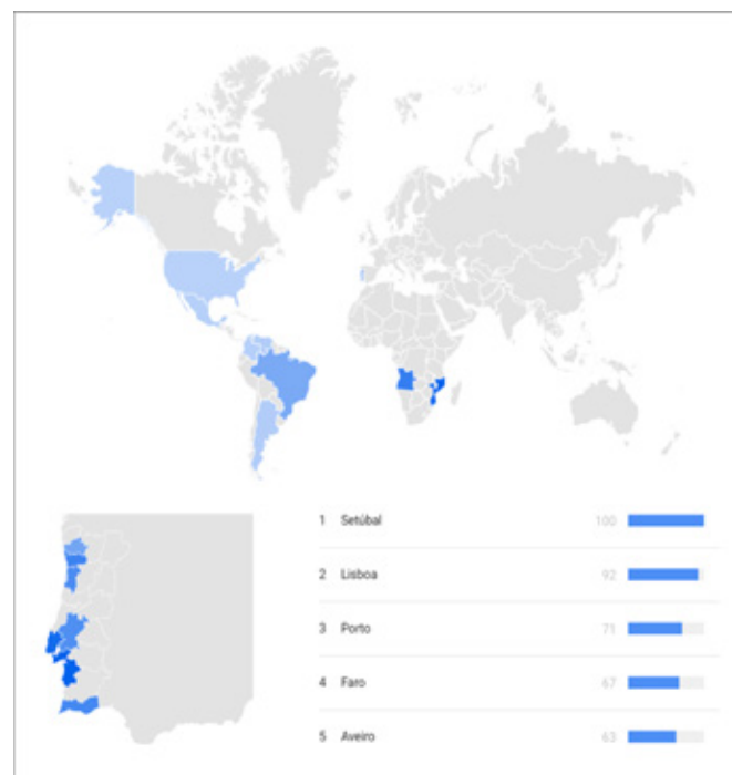
Figure 1 - IURD and the most popular online search terms in the past 5 years on Google Trends tool (values in percentage).

In Portugal such studies are almost inexistent despite the emergence of new religious movement within the metropolitan areas. Particularly interesting is the case of IURD, a religious movement which was born in Brazil in the 1970's. The movement is characterized by an expressive increase of its faithful in this country. According to the IBGE Census, the number of IURD believers increased from 269 thousand in 1991 to 2.1 million in the year 2000 (Lima, 2007). In Portugal there is no specific data about the number of practitioners. However, by searching the term IURD in Google Trends - a real-time online search data to help you gauge consumer search behaviours over time, one can understand the importance of this religion in Portugal and particularly within metropolitan areas. Setubal, Lisbon and Porto are the regions which concentrate the main interest (Figure 1 - bottom).