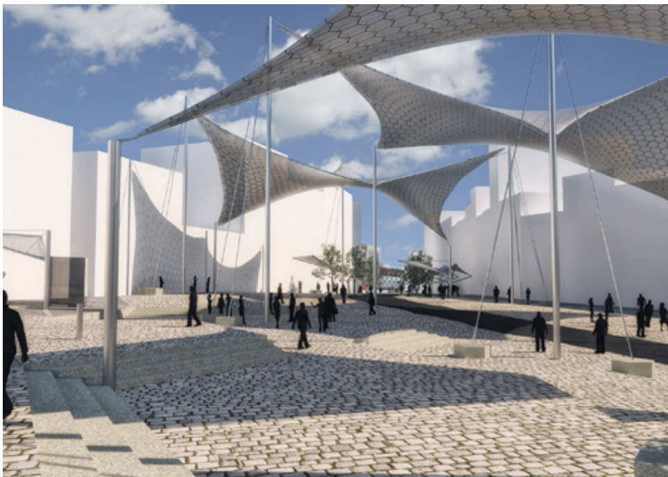
Figure 3 - 3D visualization of the final project