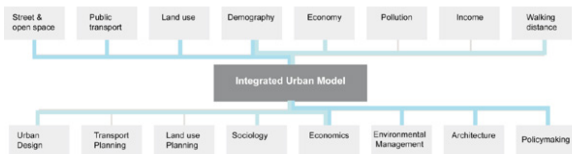
Figure 3 - Disciplines that can use the IUM to collaborate with each other

Rapidly advancing open source technologies, including OpenStreetMap, Spatial Databases and GIS, make construction of such models relatively fast, transparent and straightforward. Development of software which can collate, combine and integrate disparate data layers into models is ongoing, and offers the chance for the IUM framework to respond more quickly to new theories, discoveries and realities while retaining a central legibility and link to human outcomes.