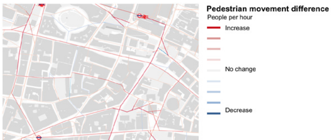
Figure 2 - Cumulative impact of future development and transport change on pedestrian movement on Bishopsgate, City of London

Given the limitations, the model still provides a new insight into the strategic hierarchy of spaces in the City of London, the key being its ability to respond to land use and transport changes. Due to its ability to predict, the model was used to develop a future forecast model for the year 2026. Land use and spatial network changes were modelled based on planning application data. Changes in transport entry and exit volumes were estimated based on a general estimate for future population uplift.